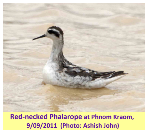
Red-necked Phalarope at Phnom Kraom, 9/09/2011

A single Red-necked Phalarope , a rare passage migrant, was photographed at Phnom Kraom on 9 September, as well as a male Greater Painted-snipe , a species previously exclusively known from Ang Tropeang Thmor in the north-west (AJ).