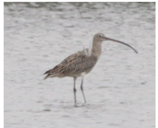
Far Eastern Curlew at Kampot, 26/3/2011

High numbers of Eastern Marsh Harriers – triple figures, and by far the largest documented flock of Baya Weavers – over 1000, were noted south of Krous Kraom on 3 February (JE). A Long-tailed Shrike at Krous Kraom on 18 February was a new record for the Tonle Sap floodplain, while four Long-toed Stints were the firsts from the Tonle Sap grasslands (HN/SVC). Chestnut-eared Bunting seems to have become a regular visitor to the Stoung grasslands in small numbers with three records this dry season: two birds at Wat Prohoot on 29 January (JE), a single there on 23 February and a single at Prolay on 11 March (HN/SVC).