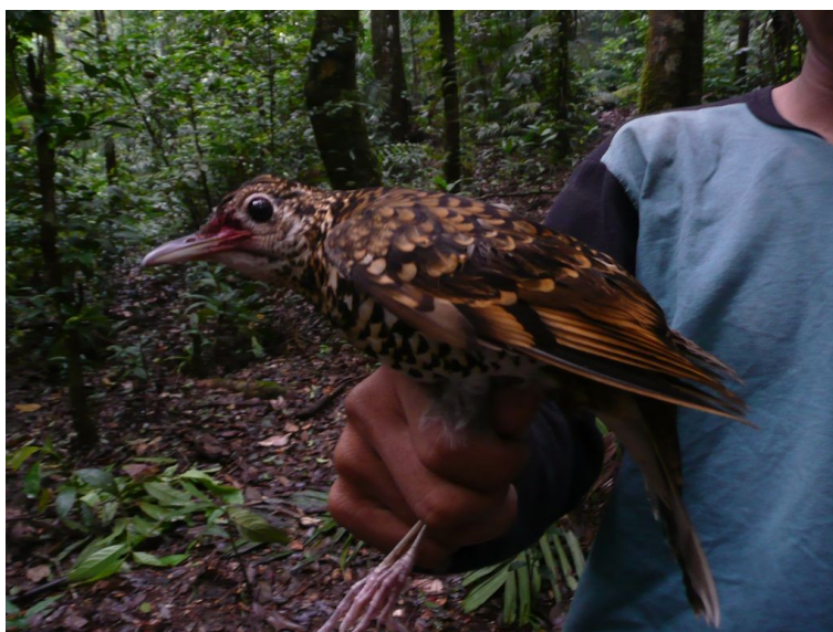
The tentative White's Thrush caught in Phnom Samkos WS, 24/3/2011.