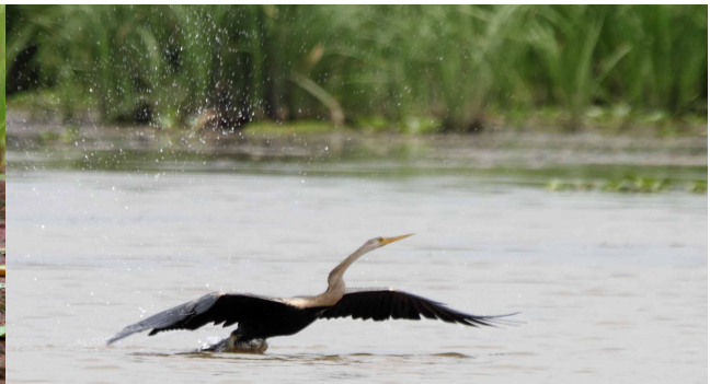
Pheasant-tailed Jacanas (left) and Oriental Darter (right) at Boeng Veal Samnap, 29/4/2011