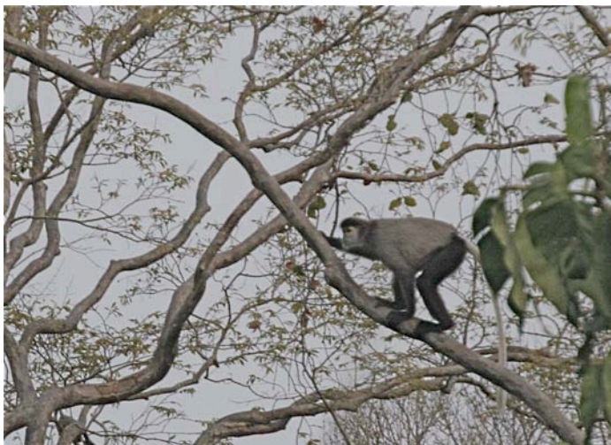
Black-shanked Douc

The SPF is home to the largest population of Black-shanked Douc in the world, along with Northern Pig-tailed and Long-tailed Macaque and Yellow-cheeked Crested Gibbon, which are regularly seen. In late February 2010 a group spotted Gaur around 9am close to the WCS Station.