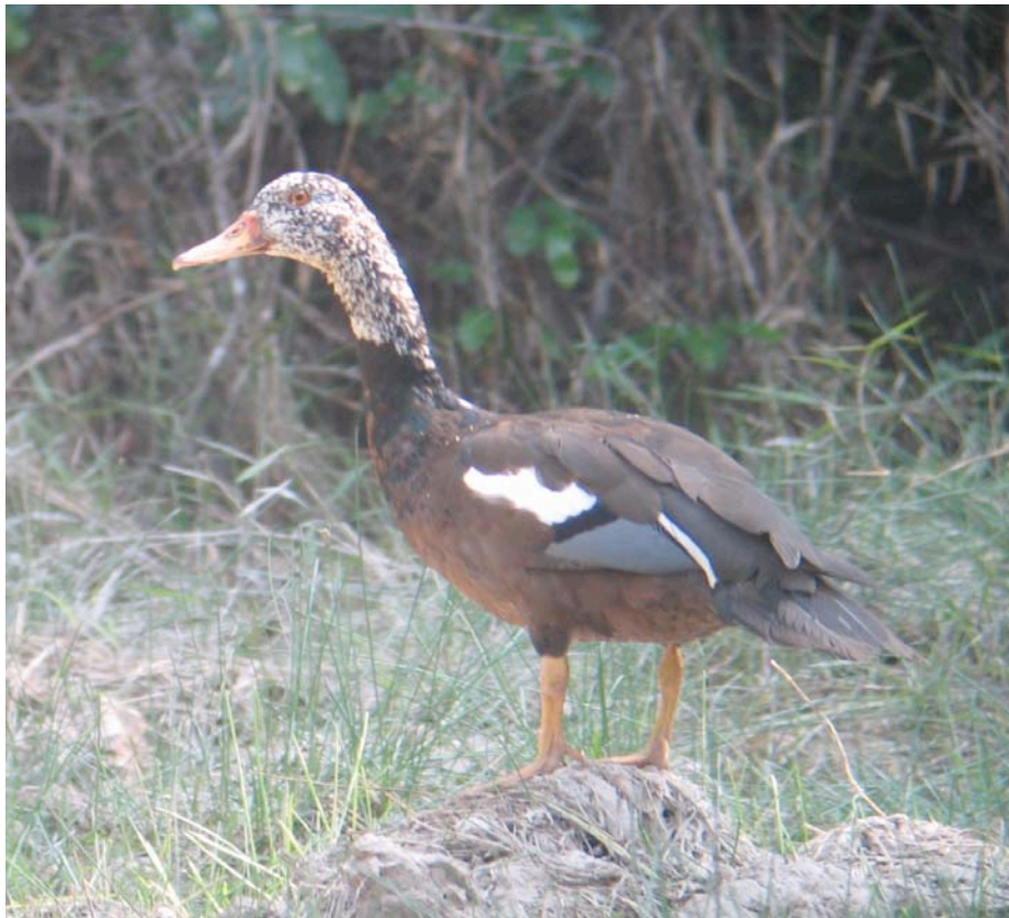
White-winged Duck at Okoki

After breakfast the group will move on approx 30 km through increasingly remote dry deciduous dipterocarp forest (DDF) to the camp site at Okoki where pools in a line of mixed evergreen forest following a water course provide habitat for White winged Duck. This is one of the most pristine parts of Cambodia with a low population density so there is a possibility of seeing mammals. Gaur were seen in 2010 and in 2009 elephants trampled through the campsite during the rainy season when no one was present. Pileated Gibbon are regularly heard and occasionally seen and there are signs of Banteng, Sambar, Wild pig, Muntjac, Long-tailed macaque, Fishing Cat and Leopard.