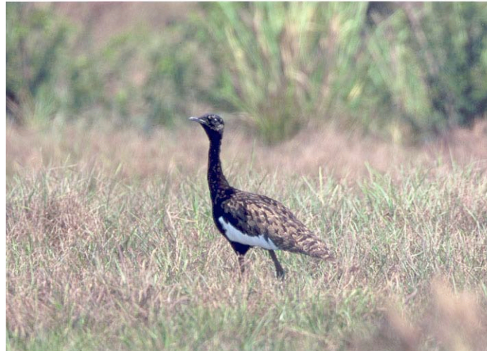
Bengal Florican in IFBA.

The critically endangered Bengal Florican and many other water-birds are found in the grasslands around the Tonle Sap lake. WCS has worked with local communities to set up Integrated Farming and Biodiversity Areas (IFBAs) to conserve prime florican habitats. SVC bird watching trips give an income to the villagers who assist the SVC Guide in locating the birds.