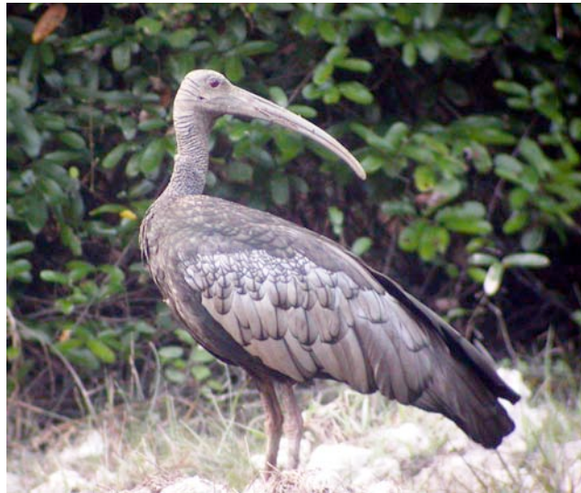
Giant Ibis at Tmatboey.

The Tmatboey Ibis Site is a conservation project set up by WCS together with the Cambodian Government and Tmatboey village. Once it was realised that the site had potential for bird watching tourism a local committee was elected which built the guest accommodation and with training from SVC provides the services for the bird watching groups that visit. In return for the income that this brings the villagers have signed no hunting and land conversion agreements.