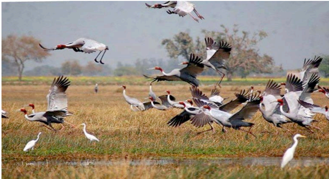
Sarus Crane at ATT.

Originating as a reservoir on the Angkorian highway 66, ATT was rebuilt as a man made reservoir by slave labour during the Khmer Rouge regime in 1976. The reservoir is now a Sarus Crane reserve administered by the Wildlife Conservation Society (WCS) with over 300 of these magnificent birds congregating to feed in the dry season along with another 198 recorded bird species, 18 of which are globally threatened. By February the dry season will be well underway and a few pairs of Black-necked Storks frequent the site along with many of the large water birds seen at Prek Toal; Black-headed Ibis, Milky and Painted Storks, Spot-billed Pelicans, Oriental Darters, Asian Openbills and Greater and Lesser Adjutants.