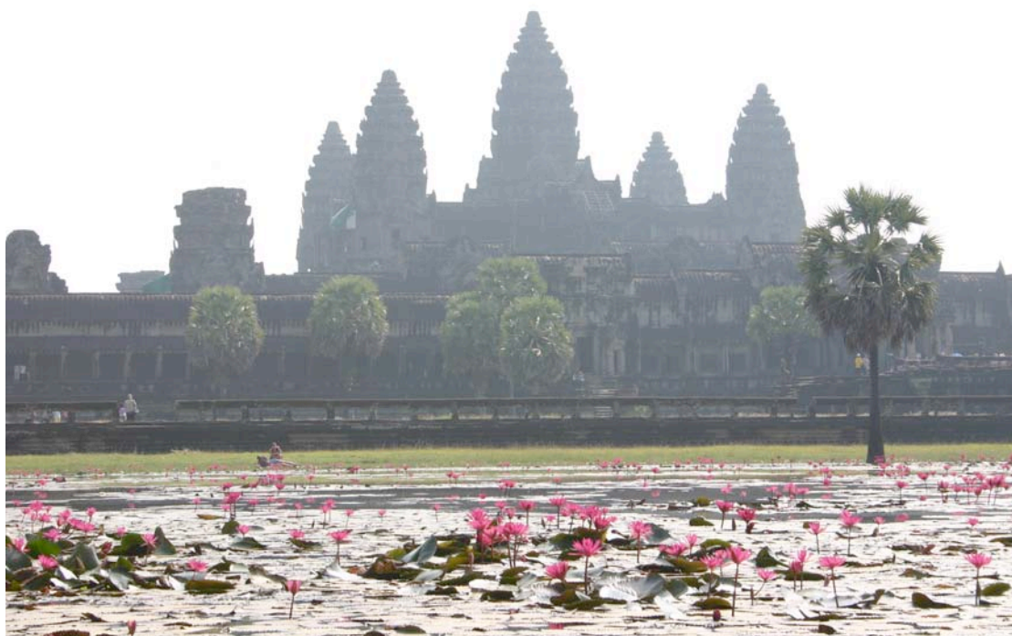
Angkor Wat.

Angkor Wat and the 200 plus temples in the Angkor Great Park are truly a wonder of the world. Apsara the Cambodian ministry responsible for the management and conservation of the temples has preserved at least some of the mature dry forest and in places allowed undergrowth to grow, which offers habitat for common species and the odd rarity. Oriental Darter in the moat, Hainan Blue, Taiga and Asian Brown Flycatchers, White-throated Rock-Thrush, Black Baza, Blue Rock Thrush, Forest Wagtails, Olive-backed Pipit, Greater Racquet-tailed Drongos, Asian Barred Owlets Coppersmith Barbet, Ashy Minivet, Yellow-browed and Pale-legged Leaf-Warbler, raucous Red-breasted and Alexandrine Parakeets and White-crested Laughing thrushes. The SVC Guide who is also a licensed temple guide will combine the trip to Angkor Wat with birding in the surrounding forest, which is a short distance from Siem Reap so sunset can be enjoyed amongst the temples and dinner in town.