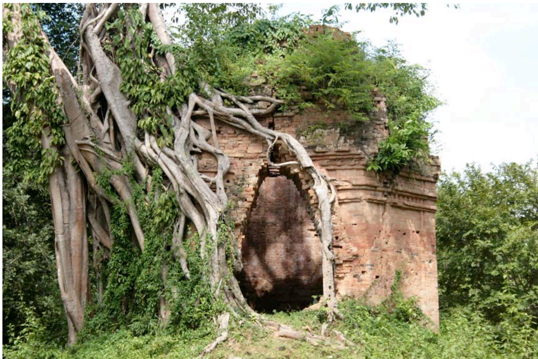
Sambor Prek Kuk, photo © Nick Butler

With the improved road the journey time has been shortened (approx. 7 hours from Okoki to Kampong Thom), which should allow for some bird watching en-route including the Tonle Sap Grasslands, this time further South around Kampong Thom. The road runs close to a significant pre Angkorian temple called Sambor Pre Kuk 30km from Kampong Thom, which offers an interesting non-birding diversion. The hotel is clean with en-suite hot showers, aircon and good Khmer food.