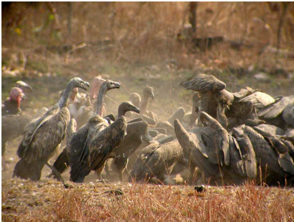
Vultures at feeding station Veal Krous

After a last morning's birding and breakfast the group will make their way to Tbeng Meanchey the Provincial Capitol of Preah Vihear Province and on to the village of Dongphlet in the Chhep Protected Forest where as part of WCS conservation program a vulture restaurant is set up to feed the 3 critically endangered species of vulture; Red-headed, White-rumped and Slender-billed.