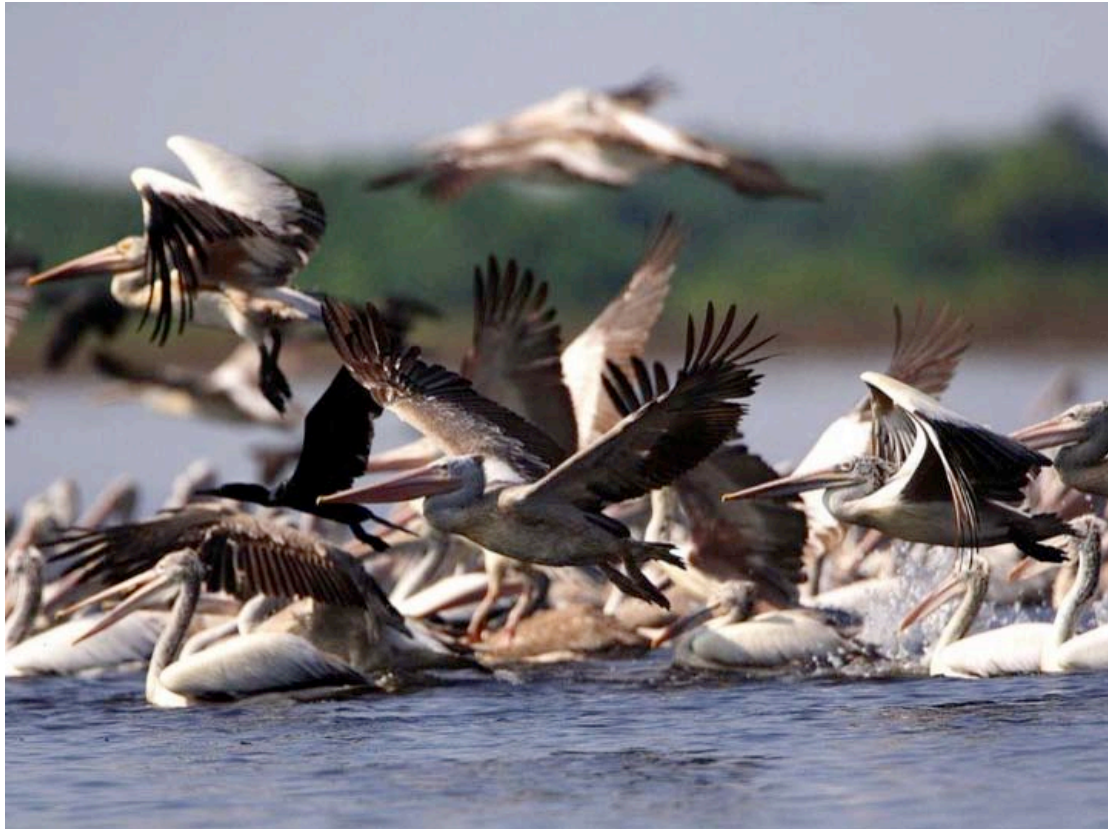
Spot-billed Pelicans in Prek Toal Core Reserve.

In Cambodia and throughout South East Asia, Prek Toal is unmatched for the number and population of endangered water birds it supports during the dry season. Large numbers of cormorants, storks and pelicans are virtually guaranteed from January to May along with herons, egrets and terns.