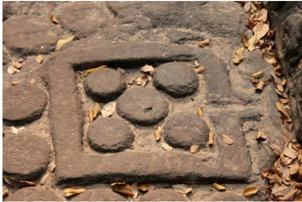
Linga in riverbed at Kbaal Spean

headed and Great Slaty Woodpecker, Grey-capped Pygmy Woodpecker. Rufous-winged Buzzard, Rufous-bellied, Crested-serpent and Changeable-hawk Eagle, Black Baza, Asian-barred and Spotted Owlet plus many orioles, bulbuls, warblers, babblers, sunbirds, etc.